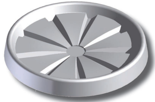
Universal Tank Tray